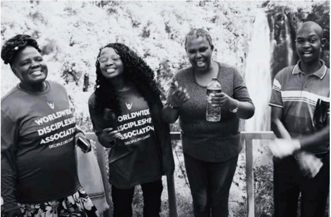
Members of the WDA Kenya Team