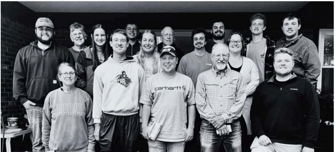
Next Generation discipleship cohort at Purdue University, Indiana

After 50 years, Worldwide Discipleship Association continues to experience strong financial health and mission impact, thanks to the faithful support of partners like you. Our ministry equips Christlike leaders who disciple others, and your generosity is helping us meet the growing demand for relational and emotionally healthy discipleship—across the U.S. and in 183 countries worldwide .