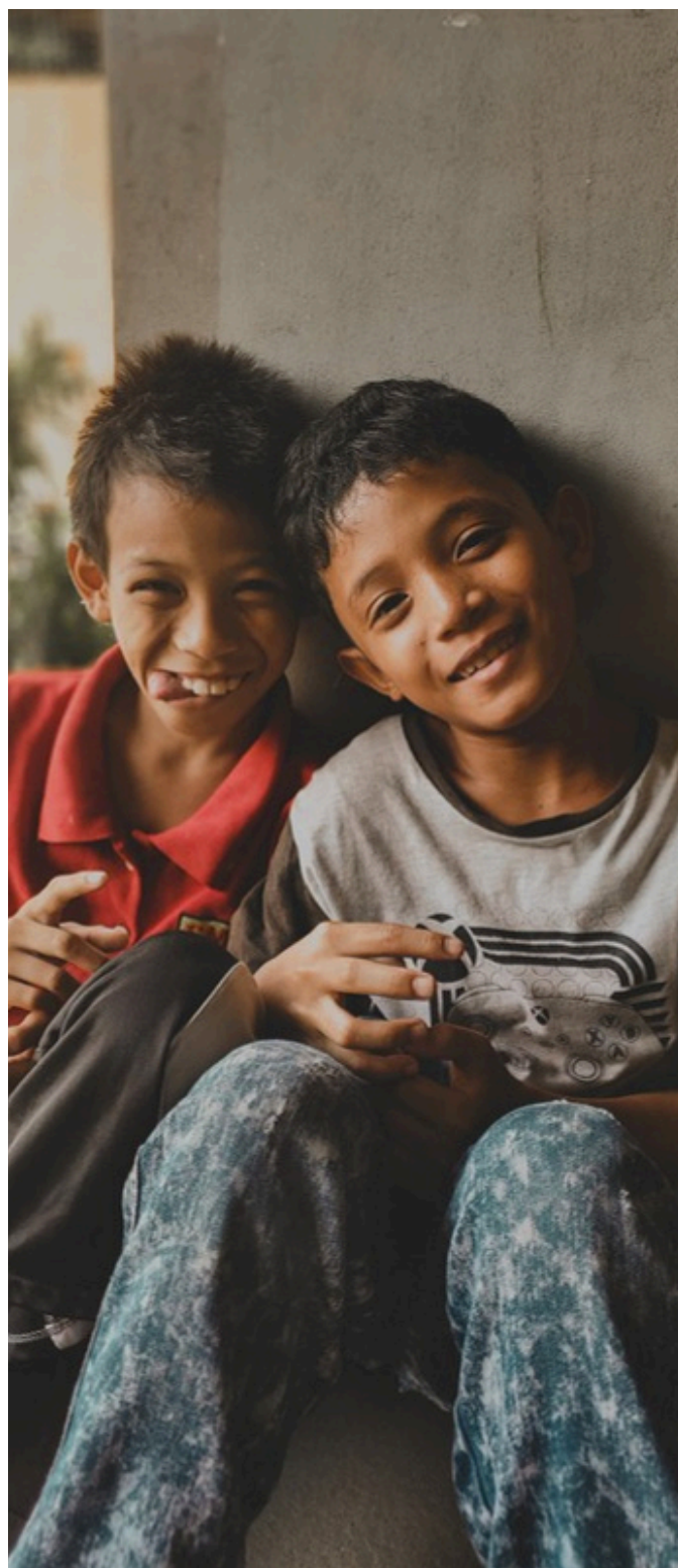
Two young orphans being cared for and discipled at Open Door Baptist Church, Philippines