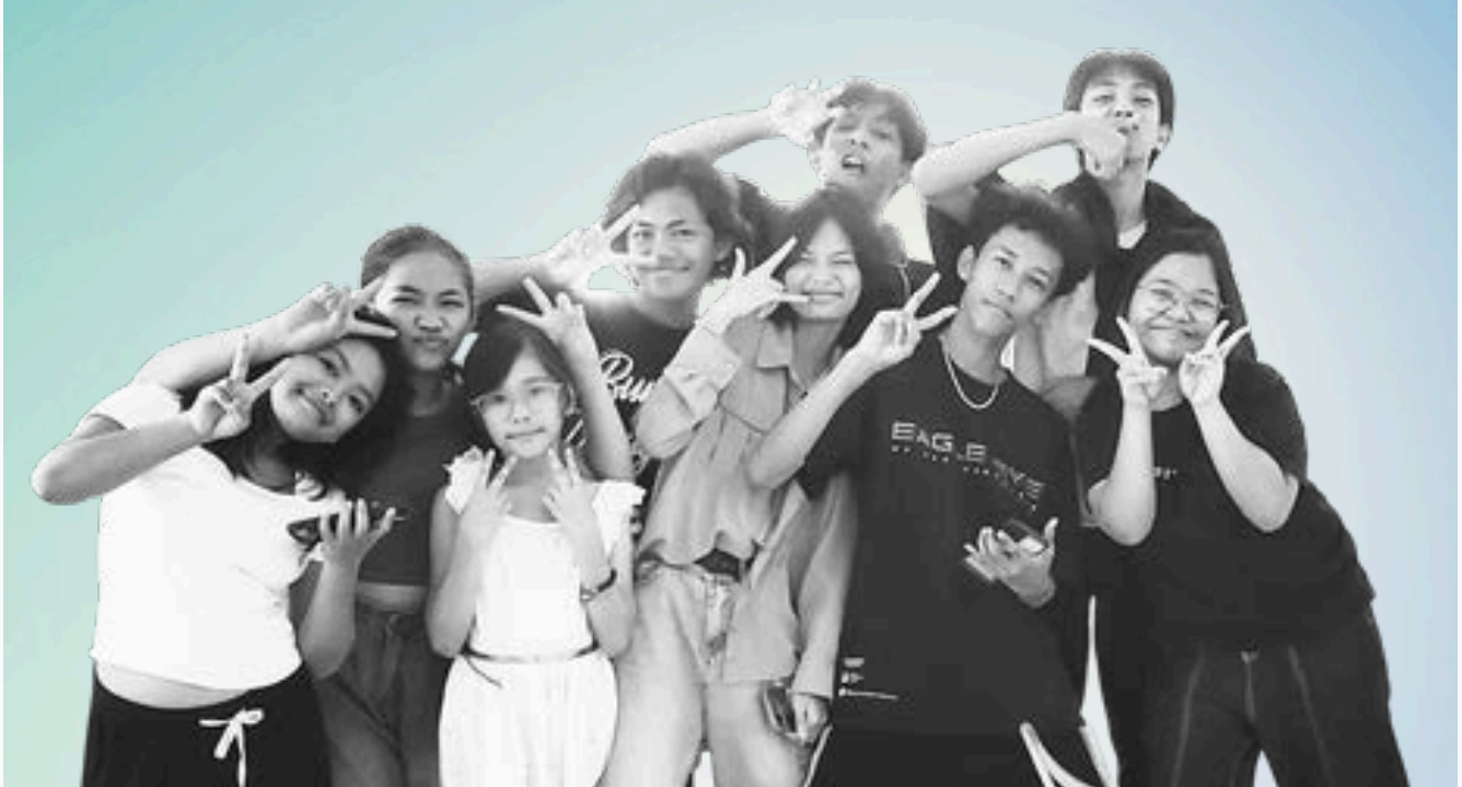
Dillman Bible Church youth discipleship cohort, Philippines

Worldwide Discipleship Association is entering an exciting new season, fueled by the passion of young leaders and rooted in the same mission that began in a living room in 1974—equipping and empowering disciple makers to think, feel, and act like Jesus and follow His blueprint for transformation. From those early prayers to today's impact in 183 countries, we honor the faithful generation who came before us while advancing with a growing global staff in a world awakening to their need for discipleship. The foundation is strong, the momentum is real, and the harvest is ready. Will you join us?